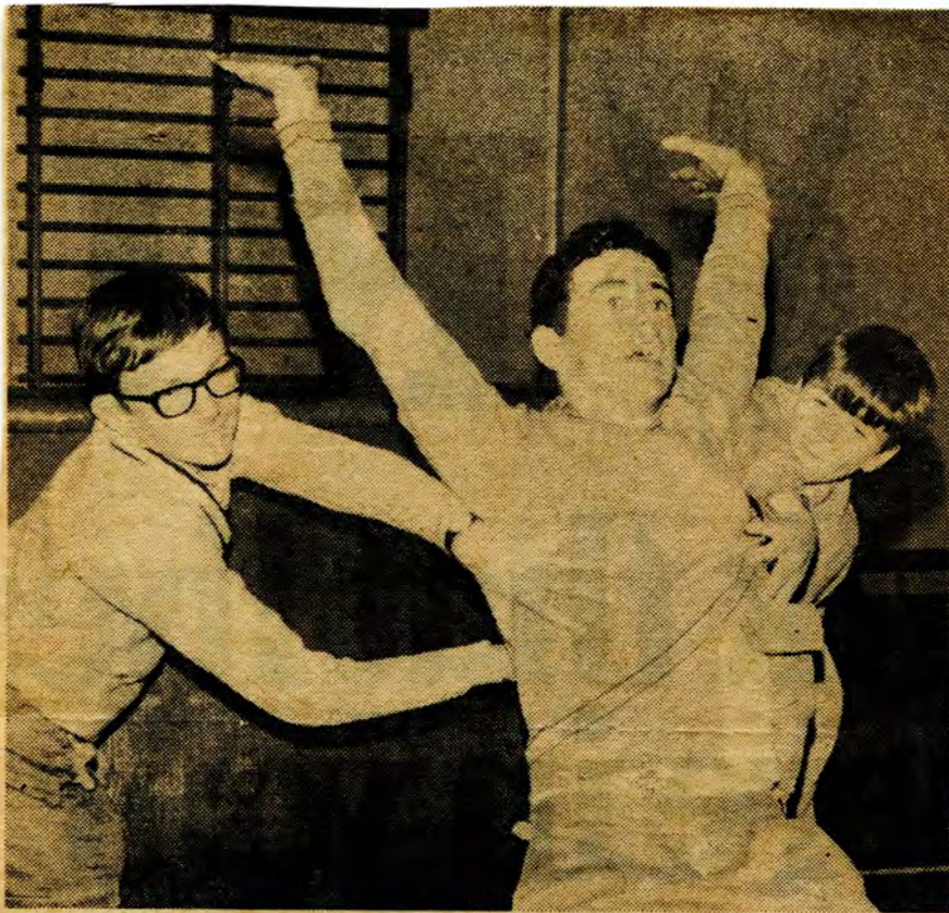
Boys at the Salvation Army Hollywood Children's Village practise leaping over a horse in the village gymnasium.