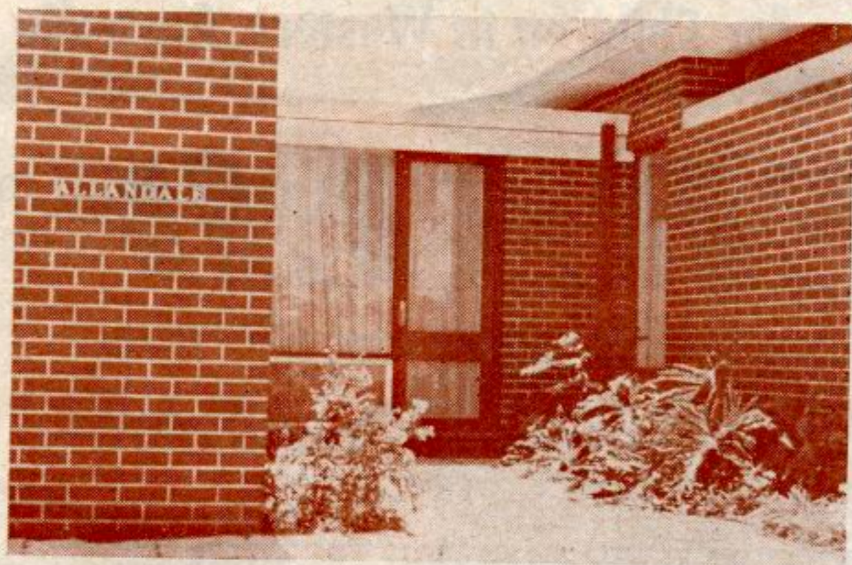
ALLANDALE BOYS COTTAGE