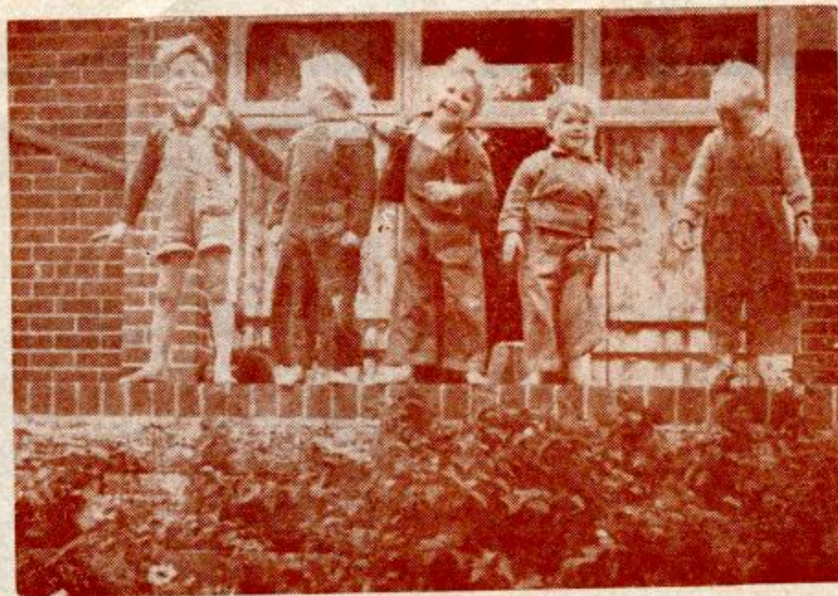
"MISCHIEF AT MOFFLYN"

CHRISTMAS is your OPPORTUNITY to help OUR Children