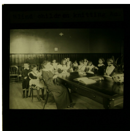
Blind Children Knitting, Royal Victorian Institute for the Blind, Melbourne, Victoria, circa 1900s

Description: This image of the the Royal Victorian Institute for the Blind shows a large, three-storey bluestone building with a central tower and two-storey wings on either side. In front of the building are gardens, lawns and trees. This image is part of the Royal Victorian Institute for the Blind Collection at Museums Victoria.