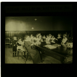
Blind Children Knitting, Royal Victorian Institute for the Blind, Melbourne, Victoria, circa 1900s

Description: This image of the the Royal Victorian Institute for the Blind shows a large, three-storey bluestone building with a central tower and two-storey wings on either side. In front of the building are gardens, lawns and trees. This image is part of the Royal Victorian Institute for the Blind Collection at Museums Victoria.