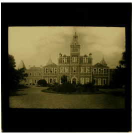
Royal Victorian Institute for the Blind, Institute Building, circa 1900

Description: This image of the the Royal Victorian Institute for the Blind shows a large, three-storey bluestone building with a central tower and two-storey wings on either side. In front of the building are gardens, lawns and trees. This image is part of the Royal Victorian Institute for the Blind Collection at Museums Victoria.