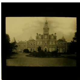
Royal Victorian Institute for the Blind, Institute Building, circa 1900

Description: This image of the the Royal Victorian Institute for the Blind shows a large, three-storey bluestone building with a central tower and two-storey wings on either side. In front of the building are gardens, lawns and trees. This image is part of the Royal Victorian Institute for the Blind Collection at Museums Victoria.