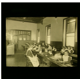
Classroom, Royal Victorian Institute for the Blind, Melbourne, circa 1900

Description: This is an image taken at the Royal Victorian Institute for the Blind in Melbourne. It shows approximately 13 children and young women seated around a table knitting. This image is part of the Royal Victorian Institute for the Blind Collection at Museums Victoria.