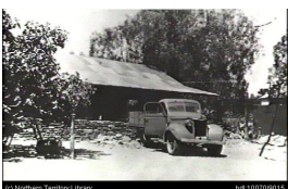
Griffiths House - building new boys dormitory

Description: Edited from the description: Griffiths House was built to accommodate children attending school in Alice Springs. Opened in 1941 as a service club.