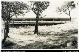
Kormilda College residential building

Description: This is a copy of a photograph from 1995. Its Northern Territory Library catalogue description is 'Kormilda College, old girls' dormitory'.