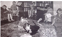
Group of children at Wanslea

Description: 'Wanslea Hostel (1943-1946) 30 Bulwer Street, in 2013' is a copy of a digital image from Google Street View, showing 30 Bulwer Street, the site of the former Wanslea Hostel (1943-1946).