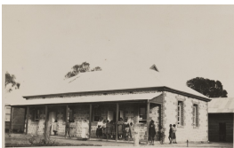
Stone Cottages, Carrolup Native Settlement, Western Australia

Description: This is an image of Carrolup in Western Australia. It shows a group of women and children standing in front of a large stone and brick cottage. Smaller timber buildings are visible in the background.