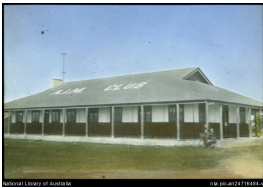
Australian Inland Mission Club House, Carnarvon, Western Australia [transparency]