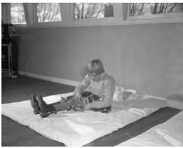
Wingfield Home, Physiotherapy Department gym, children wear long callipers (jointed) to correct knee flexion problem, child 11 years can cope with own callipers