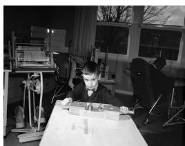
Wingfield Home, Occupational therapy, sandpapering to encourage extension of elbow and wrist