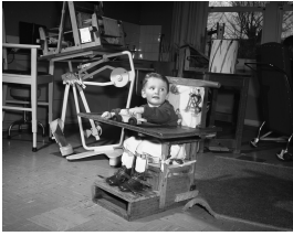
Wingfield Home, Occupational therapy, child in posture chair with tray