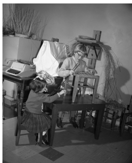
Wingfield Home, Occupational therapy, stool seating for co-ordination and strengthening of upper limbs