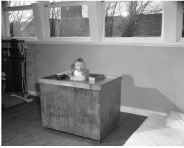
Wingfield Home, Physiotherapy Department gym, standing box stimulates posture reflexes in training to stand and walk