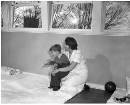
Wingfield Home, Physiotherapy Department gym, one of a series of exercises used to re-educate strength and control for standing