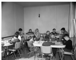
Wingfield Home, Occupational therapy, the dining room is used for the teaching of children in the use of table procedure at each meal time