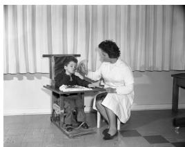
Wingfield Home, Occupational therapy, the feeding of each child who cannot complete his own meal is important