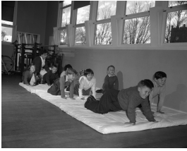
Wingfield Home, Physiotherapy Department gym, class work for cerebral palsied children to teach control and strength