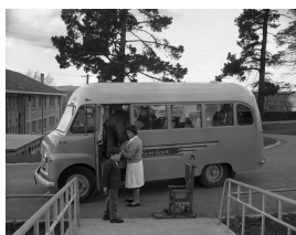
Wingfield Home, children entering bus