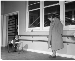
Wingfield Home, Physiotherapy Department gym, assisting medical officer checks the use of a walking 'moveline' for a baby