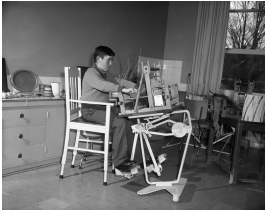
Wingfield Home, Occupational therapy, weaving on the kick machine, co-ordination of hands and legs