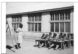
School at Ernabella Mission

Description: The library catalogue includes the description: A class of Aboriginal students and their teacher outside the school at Ernabella Mission.