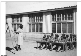
School at Ernabella Mission

Description: The library catalogue includes the description: A class of Aboriginal students and their teacher outside the school at Ernabella Mission.