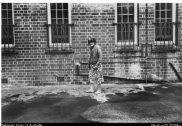
A woman standing barefoot outside Northfield Mental Hospital, South Australia