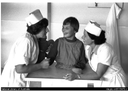
Two nurses with a young girl at Northfield Mental Hospital, South Australia