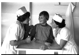
Two nurses with a young girl at Northfield Mental Hospital, South Australia