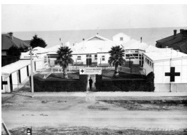
Adelaide, South Australia. A section of the Lady Galway Convalescent Home at Henley Beach.

Description: This is a copy of a photograph of the Lady Galway Convalescent Home for ex-servicemen in Henley Beach. In 1946, these premises became the Lady Hore-Ruthven Junior Red Cross Home.