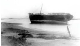
Boys Reformatory Hulk, Fitzjames

Description: This photo is undated, the date included is an estimate. This webpage is no longer in operation. This URL is taken from the wayback machine and is dated 12 March 2022.