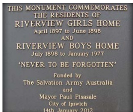
Plaque on memorial plinth at Riverview