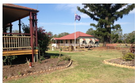
Looking towards visitor residence