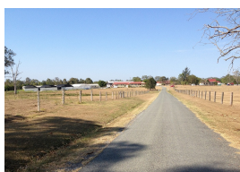
Entrance drive Riverview

Description: The Salvation Army has occupied this site since 1897. The avenue of pines was planted c.1920s.