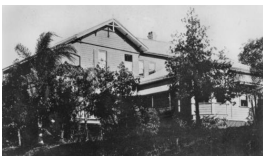
Salvation Army Home at Taringa, Brisbane, 1914

Description: This image shows the Industrial School for Girls, Toowong.