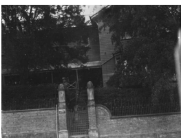
Salvation Army Home in Church Street, Toowong, 1932

Description: This library catalogue states the image was copied and digitised from an image appearing in the Sunday Truth, 28 February 1932, p. 11.