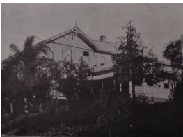
Toowong, Qld., 1914

Description: This image shows the Industrial School for Girls, Toowong.