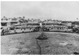
Benevolent Institution at Toowoomba, ca. 1902

Description: The library catalogue includes this description: Many large buildings are contained in the grounds of the Asylum for the Insane.