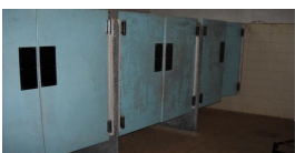
Shower Stalls [Baillie Henderson]

Description: The image include the following caption: 1915 - General view of the Toowoomba Hospital for the Insane, showing the recreation hall and garden.