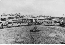
Benevolent Institution at Toowoomba, ca. 1902

Description: The library catalogue includes this description: Many large buildings are contained in the grounds of the Asylum for the Insane.