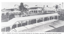
General view of hospital - 1915

Description: This photo is undated, the date included is an estimate.