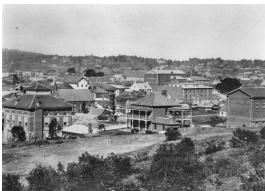
Lady Bowen Hospital in Brisbane, ca. 1875

Description: This description was included on the library website: Lady Bowen Hospital located in the centre and to the right, behind the Government Roads Depot (long low building in the foreground.) Government House can be seen in the centre of the background.