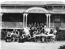
Children pictured outside the Montrose Home for Crippled Children

Description: The library catalogue includes this description: Young girl sitting on a rug at the Montrose Crippled Children's Home, playing dress-ups with her dolls. Many different styles of dolls' hats are scattered across the floor.