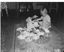
Young girl playing with her dolls, 1952 [altered from original title]

Description: This is an image of the Montrose Home for Crippled Children at Taringa. It shows a large single-storey house with enclosed front verandahs and a large double staircase leading to the front from the driveway. This image is undated, the date included is an estimate