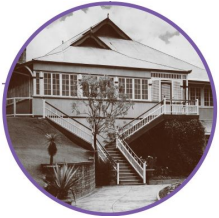
Montrose Home for Crippled Children, Taringa

Description: This is an image of the Montrose Home for Crippled Children at Taringa. It shows a large single-storey house with enclosed front verandahs and a large double staircase leading to the front from the driveway. This image is undated, the date included is an estimate