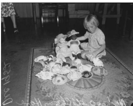
Young girl playing with her dolls, 1952 [altered from original title]

Description: This is an image of the Montrose Home for Crippled Children at Taringa. It shows a large single-storey house with enclosed front verandahs and a large double staircase leading to the front from the driveway. This image is undated, the date included is an estimate