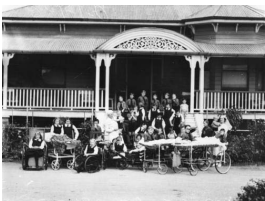
Children pictured outside the Montrose Home for Crippled Children

Description: The library catalogue includes this description: Young girl sitting on a rug at the Montrose Crippled Children's Home, playing dress-ups with her dolls. Many different styles of dolls' hats are scattered across the floor.