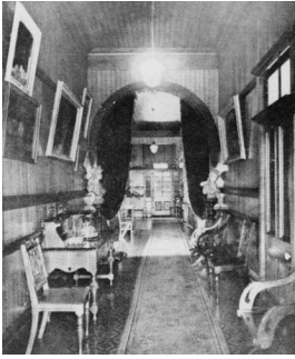
Elegantly furnished hallway of Montrose in Taringa