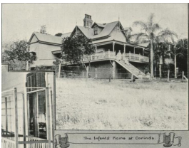
The Infant's Home at Corinda

Description: This is an image of the exterior of the Corinda Infant's Home. It shows a large two-storey wood-clad house with a front verandah and stair-case leading to the elevated entrance. It is surrounded by a simple fence of wooden posts and wire. This image was published in the Queenslander Pictorial , a supplementary publication to The Queenslander , on 29 June 1918. The caption was supplied by the Queenslander Pictorial .