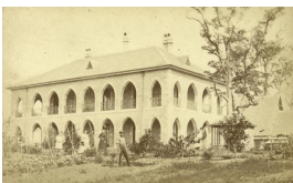
Bishopsbourne in Milton

Description: This photo is undated, the date included is an estimate only.