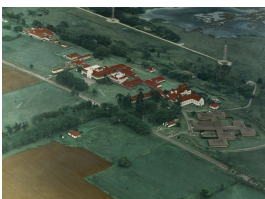
Aerial photo of St Vincent's Orphanage, ca. 1970