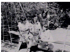
Social workers playing with State wards at Montrose C.L.P.U., Burwood

Description: This is an image of a bedroom at Montrose Child Protection Centre taken in June 1979. Please note that the State Library of New South Wales collection includes more digitised images of Montrose Child Protection Centre taken by the Government Printing Office, including images of the exterior and interiors of the Child Protection Centre, staff, children and parents.