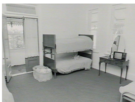
Montrose Child Protection Centre

Description: This is an image of a bedroom at Montrose Child Protection Centre taken in June 1979. Please note that the State Library of New South Wales collection includes more digitised images of Montrose Child Protection Centre taken by the Government Printing Office, including images of the exterior and interiors of the Child Protection Centre, staff, children and parents.