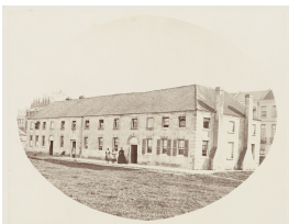
158. Female School of Industry SH 577