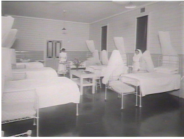
Montrose Maternity Hospital, Burwood: "B" ward, 8 beds