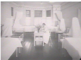
Montrose Maternity Hospital, Burwood: "A" ward, 4 beds