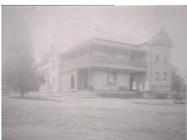
Montrose Maternity Hospital, Burwood