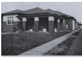
"Worimi" - opened on 30th June, 1966 at Newcastle

Description: This series of pictures is captioned as being of the Worimi Centre at Wollongong, but there has never been such an organisation. This is thought to refer to the Worimi Centre at Newcastle.