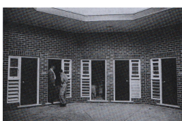
"Worimi" - rooms for inmates. There are boy boys and girls at "Worimi" [original caption]

Description: This is a copy of an image that appeared in the Child Welfare Department of New South Wales Annual Report of 1966.