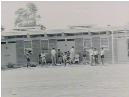
Athletics Day, Minda Remand Centre