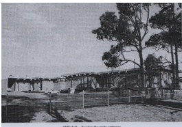
Minda main entrance

Description: This is a copy of an image that appeared in the Child Welfare Department of New South Wales Annual Report of 1965.