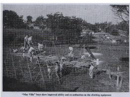
"May Villa" boys show improved ability and co-ordination on the climbing equipment

Description: This is a copy of an image that appeared in the Child Welfare Department of New South Wales Annual Report of 1964.