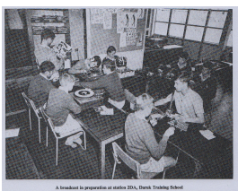
A broadcast in preparation at station 2DA, Daruk Training School

Description: This is a copy of an image that appeared in the Child Welfare Department of New South Wales Annual Report of 1961.