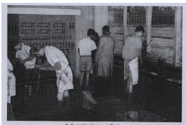
In the metal-work room at Daruk

Description: This images shows the recreation room at Daruk.