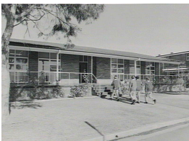
Series for pamphlet on Daruk

Description: This image is of murals on the wall at Daruk.