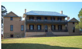
Eastwood Brush Farm House

Description: This image was posted on Wikimedia Commons. The descriptions states: Brush Farm House, Eastwood, Sydney.