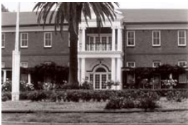
William Thompson Masonic School

Description: This photo is undated, the date included is an estimate.