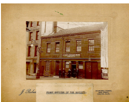
First offices of the Society

Description: This photograph is of a Sydney Rescue Work Society office and is from papers held by Integricare. This photo is undated, the date included is an estimate.