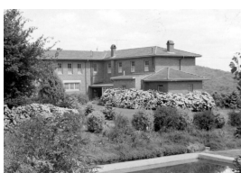
Mt Gibraltar, with swimming pool

Description: This is a digital copy of an image published in an article in the Southern Highland News on 7 September 2015.