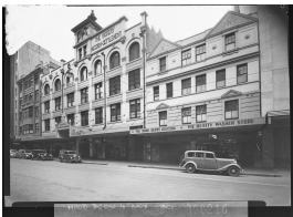
Central Methodist Mission