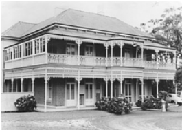
The Nest (Arncliffe Girls Home)

Description: This photo is undated, the date included is an estimate.