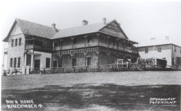
Kincumber orphanage c1913

Description: This image is hosted on the Gosford Library's Flickr page - Gostalgia: local history from Gosford Library's photos.