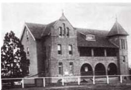
St Vincent's Boys' Home

Description: This photo is undated, the date included is an estimate.