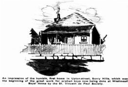
An impression of the humble, first home in Upton-street, Surry Hills, which was the beginning of the great work for orphan boys now being done at Westmead Boys' Home by the St. Vincent de Paul Society.