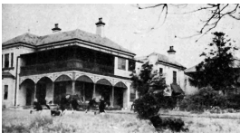
The Murray-Dwyer Orphanage at Mayfield West

Description: This photo is undated, the date included is an estimate.