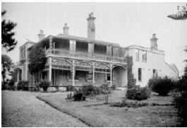
Murray Dwyer Boys' Home

Description: This photo is undated, the date included is an estimate.