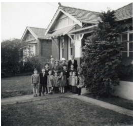
Ruhamah Orphanage/Boys Home at South Hurstville