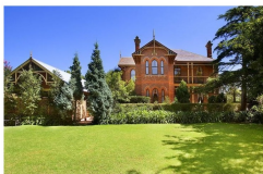
29 Bevan Place Carlingford: "Havilah House" - Regal Estate 1588sqm

Description: This photo is undated, the date included is an estimate.