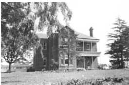
Havilah Little Children's Home

Description: This photo is undated, the date included is an estimate.