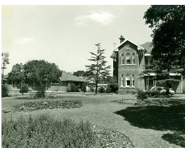
Havilah - Carlingford - 754 Pennant Hills Road Carlingford (29 Bevan Place Carlingford)

Description: This is an image that appeared in a real estate listing in Homehound in 2012.