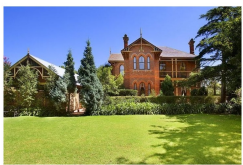
29 Bevan Place Carlingford: "Havilah House" - Regal Estate 1588sqm

Description: This photo is undated, the date included is an estimate.