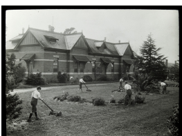
Boys mowing the lawn

Description: This is a photograph showing one of the dormitories at the Clifden Farm and Try Boys Home at Wedderburn. It is part of the Try Boys Society Collection of photographs held by the State Library of Victoria.