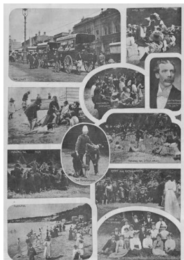
The Ragged School Children's Picnic

Description: This is a copy of a photograph published in 'One Thousand White Onions': a history of caring for children since 1865 on p.20.