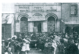
Waiting for the Christmas Feast at the Ragged Boys Home and Mission, Latrobe Street, Melbourne

Description: This is a copy of a photograph published in 'One Thousand White Onions': a history of caring for children since 1865 on p.21.