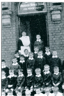
Matron and her charges at the Melbourne Ragged Boys Home

Description: This is a copy of a photograph published in 'One Thousand White Onions': a history of caring for children since 1865 on p.7.