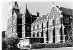
Victorian School for Deaf Children