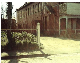
Elizabeth Fry Retreat (later Swinborn Lodge), South Yarra