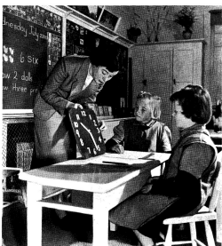
Pleasant Creek Special School

Description: This image appeared in the Department of Mental Hygiene's annual report for 1953.