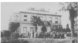
St Anthony's Home, Kew [title altered from original]