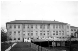
St Anthony's Home, Kew, buildings [rear]