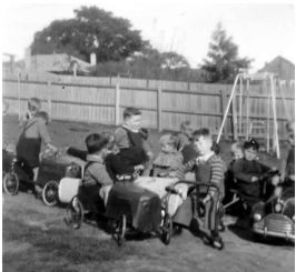
St Anthony's Home, Kew, children in cars