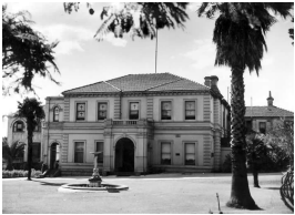
St Anthony's Home, Kew, building