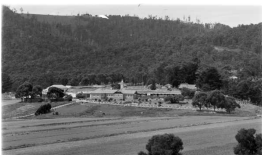
The Salvation Army Boys' Home, The Basin, Vic.