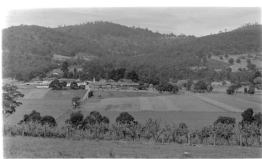
Salvation Army Home near Boronia, Vic.