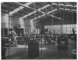
New woodwork shop at Bayswater Youth Training Centre, constructed entirely by staff and trainees

Description: This is a copy of an image published in the annual report of the Social Welfare Department for 1970-1.