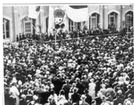
Oakleigh Convent and Church

Description: Photo of the opening of the chapel at the Convent of the Good Shepherd, Oakleigh.