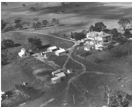
Kilmany Boys Home and typical farm in the Sale area