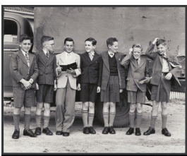
Seven boys stand beside a covered truck at Kilmany Park Boys Home, Sale, Victoria