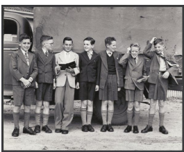
Seven boys stand beside a covered truck at Kilmany Park Boys Home, Sale, Victoria