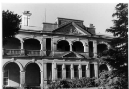
Kilmany, 'Kilmany Park' [exterior]