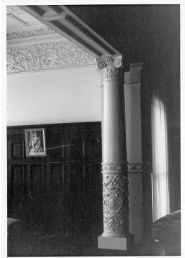
Kilmany, 'Kilmany Park' [interior]