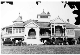
St Cuthbert's in Colac